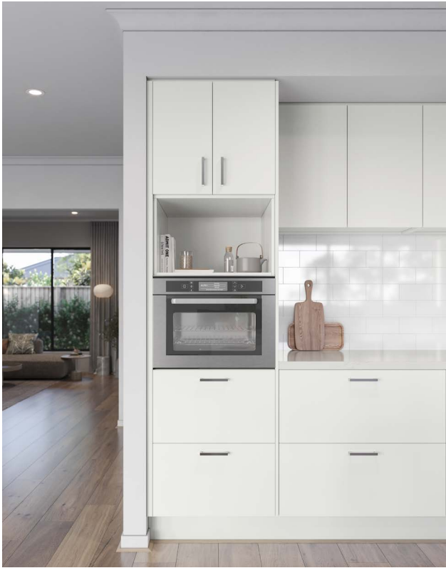
WALL TOWER OPTION 3 QTY Single appliance tower with open shelf and double door cupboard above, and double pot drawers below.