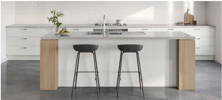
ISLAND BENCH OPTION 2 — BOX CAPS/NIBS 40mm stone benchtop with feature 280mm nibs including 32mm shadowline.