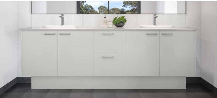
TWIN VANITY OPTION 1 Twin vanity with 2 drawers up to 2800mm. Nominate location: