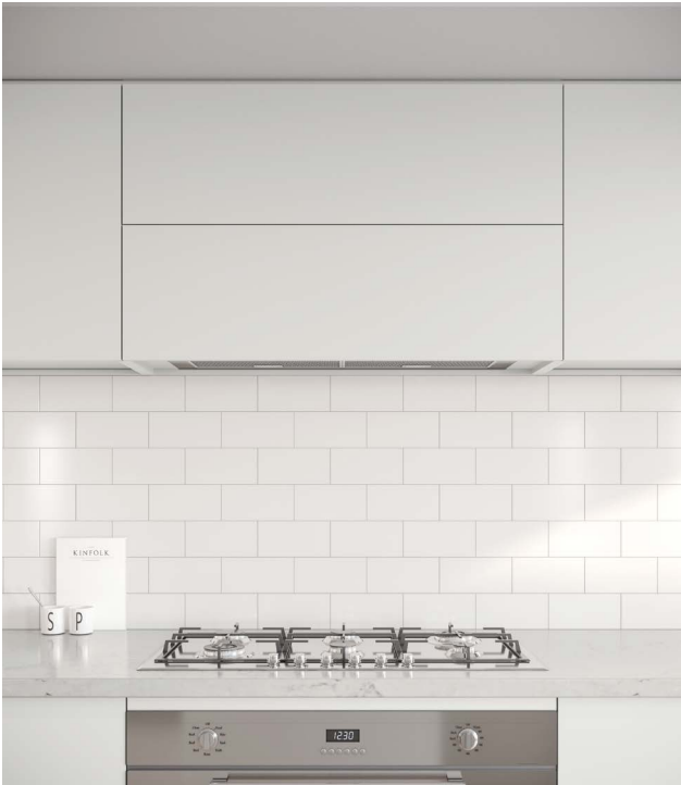
RANGEHOOD OVERHEAD OPTION 2 Double fold lift up door.