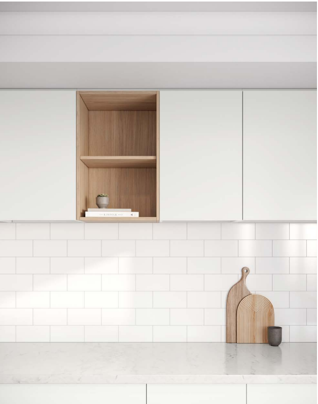
OVERHEAD CUPBOARD OPTION 3B Open adjustable shelf on left and single cupboard. Nominate location