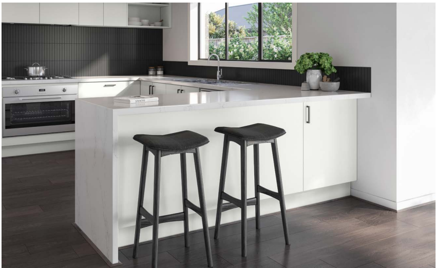
PENINSULA BENCH OPTION 2 – CUPBOARD TO REAR AND STONE END PANEL 40mm stone benchtop with single stone dropped end panel and single door cupboard.