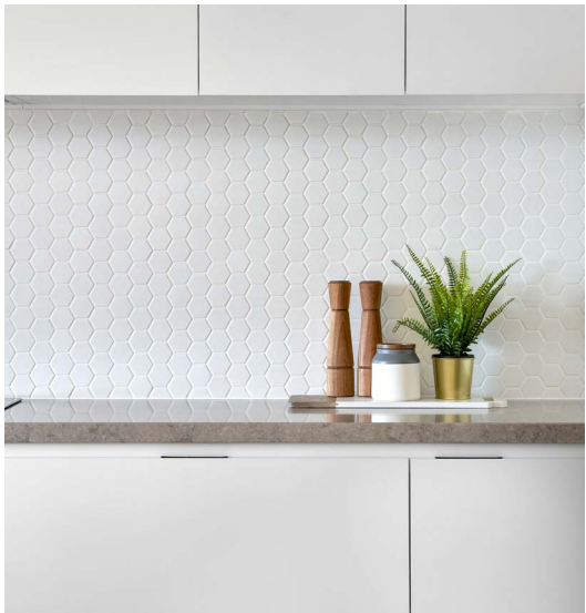
2 Pac cabinetry finish to match your interior style.