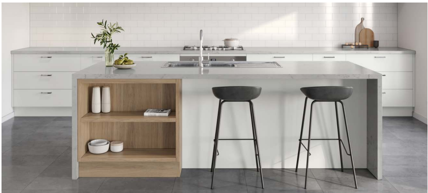
ISLAND BENCH OPTION 3 — OPEN SHELVES TO REAR 40mm stone benchtop with double stone dropped end panels and feature underbench open shelves.