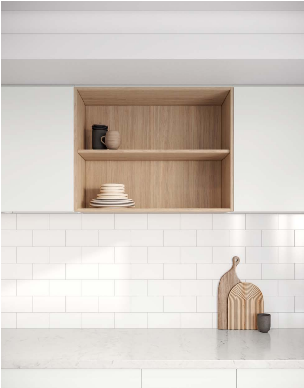
OVERHEAD CUPBOARD OPTION 1 Double open shelf with adjustable shelf. Nominate location