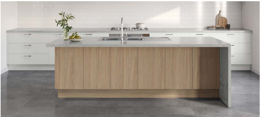
ISLAND BENCH OPTION 5 — CABINETRY TO REAR (ENTIRE LENGTH) 40mm stone benchtop with single stone dropped end panel and row of underbench cupboards (design specific).