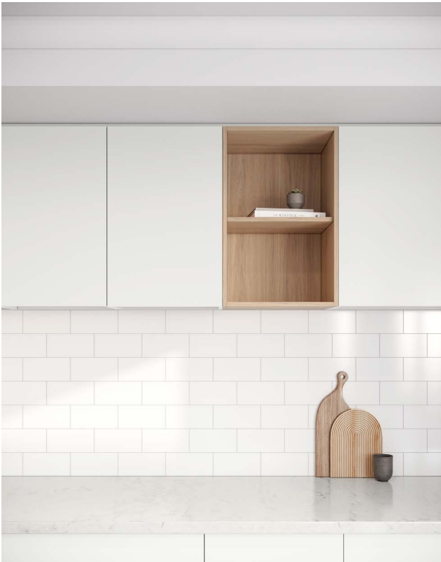
OVERHEAD CUPBOARD OPTION 3A Open adjustable shelf on right and single cupboard. Nominate location