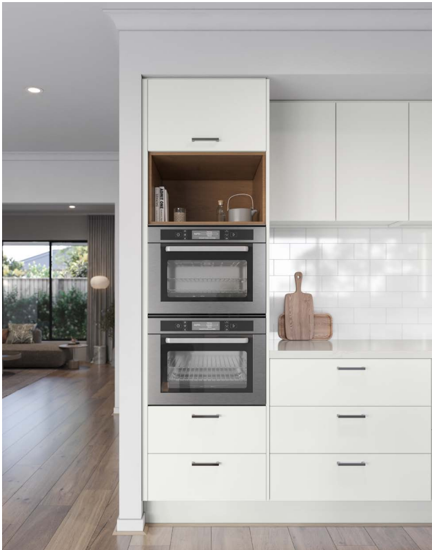
WALL TOWER OPTION 5 QTY Double oven tower with open shelf and single lift-up door cupboard above, and double pot drawers below.