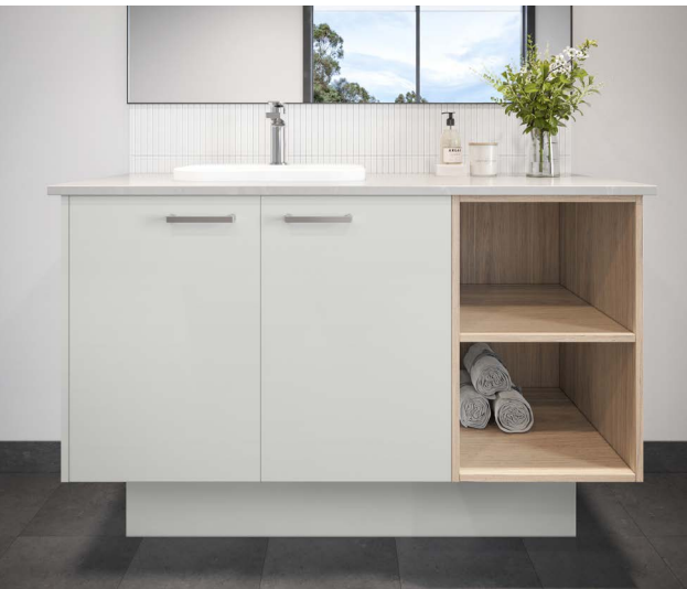
EXTENDED VANITY OPTION 3 Extended vanity with open feature shelving up to 1000mm. Nominate location: