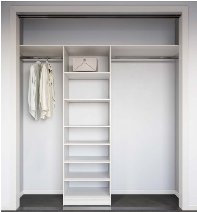
BUILT-IN ROBE OPTION 7

Up to 2340mm high robe with 600mm wide drawer unit with single hanging rail to each side. Nominate location: