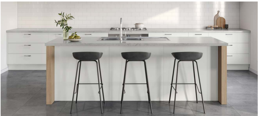
ISLAND BENCH OPTION 7 — BOX CAPS/NIBS 40mm stone benchtop with feature 80mm laminate end panels including 16mm shadowline.