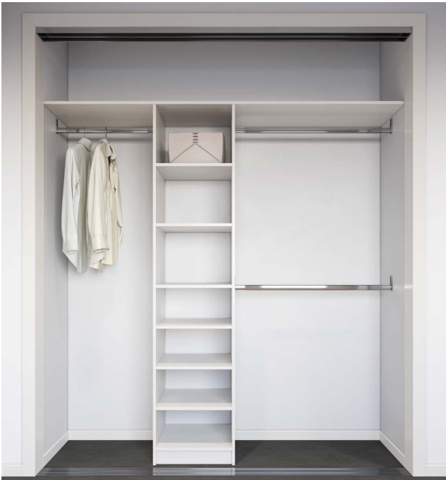
BUILT-IN ROBE OPTION 4

Up to 2340mm high robe with 450mm wide shelving and single hanging rails to each side. Nominate location: