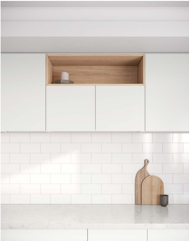
OVERHEAD CUPBOARD OPTION 4A Open shelf on top and double door cupboard. Nominate location