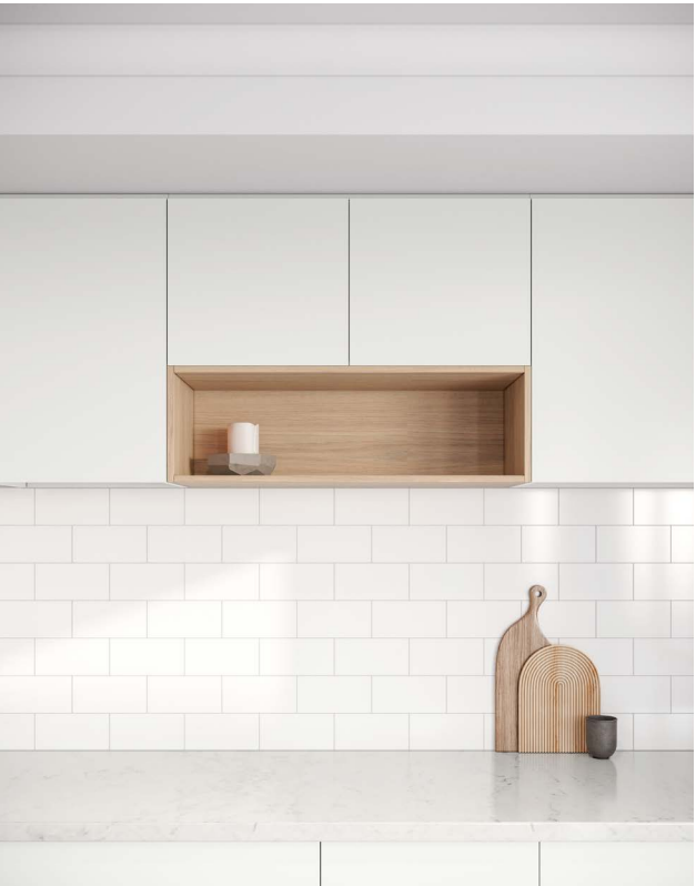
OVERHEAD CUPBOARD OPTION 4B Open shelf on bottom and double door cupboard. Nominate location