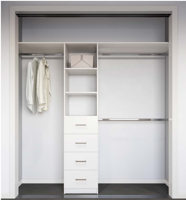
BUILT-IN ROBE OPTION 5

2340mm high robe with 450mm wide shelving and double hanging rails to one side. Nominate location: