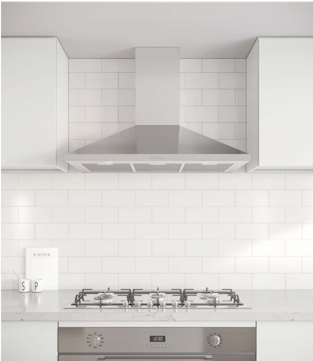
STANDARD 900mm canopy rangehood.

These Rangehood selections come in a variety of styles and designs, allowing you to choose one that complements the overall aesthetic of your kitchen and home.