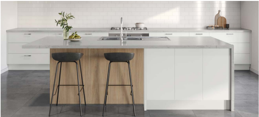
ISLAND BENCH OPTION 4 — CABINETRY TO REAR 40mm stone benchtop with extended overhang and single stone dropped end panel, and row of underbench cupboards (design specific).