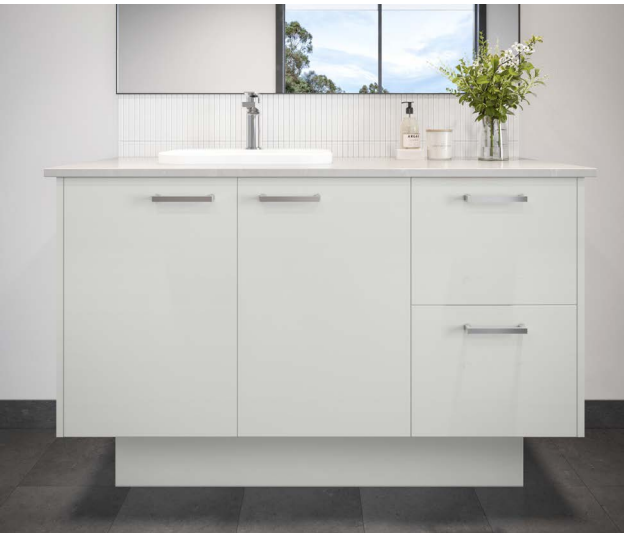
EXTENDED VANITY OPTION 2 Extended vanity with 2 drawers up to 1000mm. Nominate location: