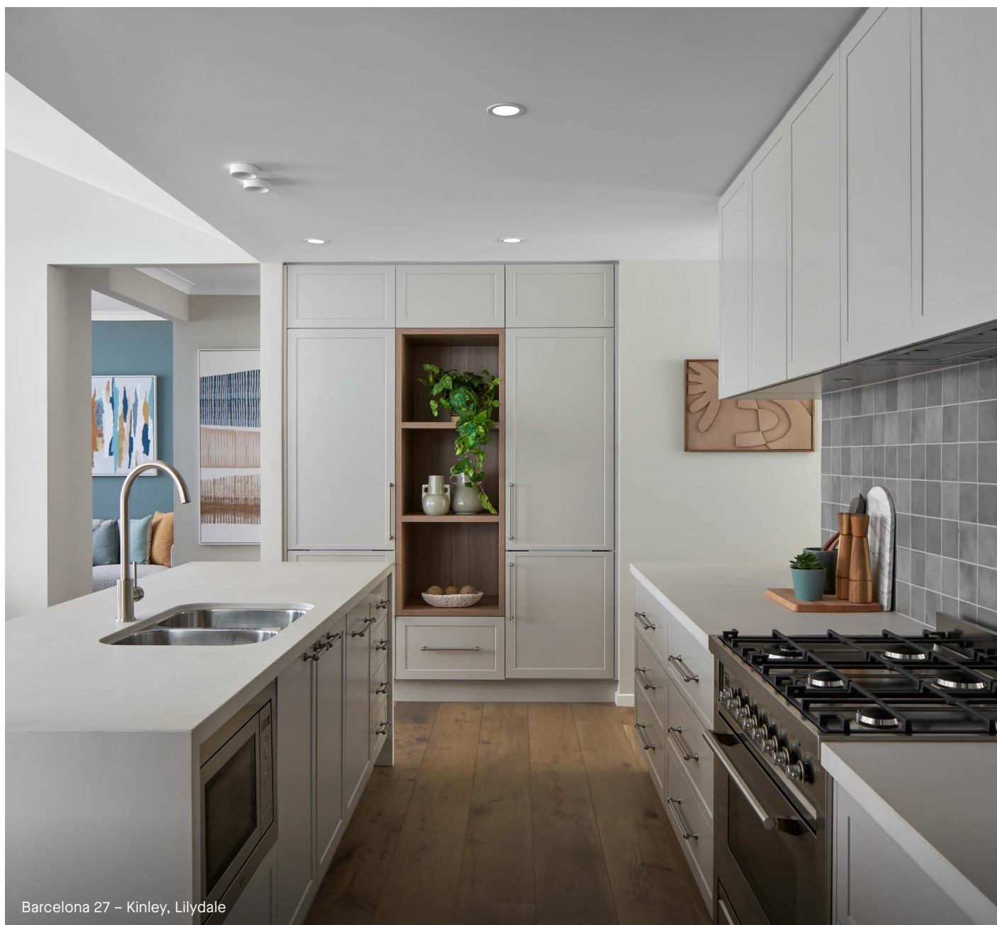
Barcelona 27 – Kinley, Lilydale