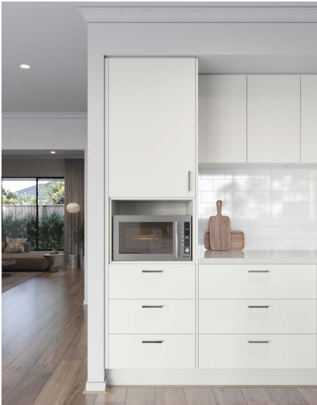
WALL TOWER OPTION 1 QTY Single microwave tower with single door cupboard above and triple pot drawers below.

Depending on your lifestyle, select one of the curated options to best suit you.