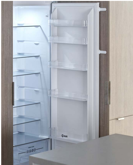
Integrated appliances (refrigerators and dishwashers).