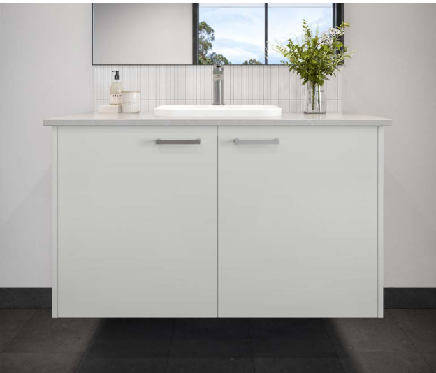
FLOATING VANITY Floating vanity up to 1000mm. Nominate location: