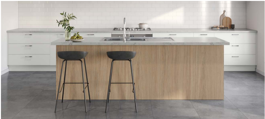
STANDARD 40mm stone benchtop and laminate backing to base.

The kitchen island bench, also commonly known as the heart of the kitchen, has a selection of options with various design features to suit your style and needs.