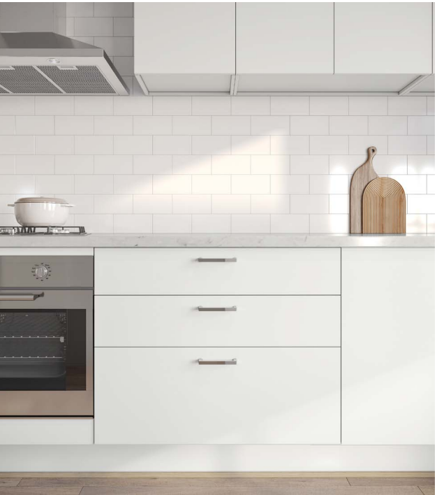
DRAWER OPTION 2 2 small drawers and 1 large drawer up to 600mm wide 2 small drawers and 1 large drawer up to 1000mm wide