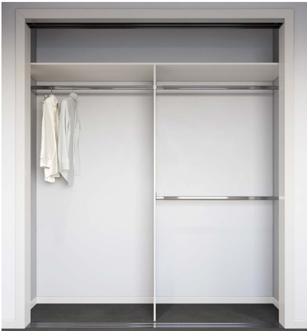
BUILT-IN ROBE OPTION 3

Up to 2340mm high robe with 450mm wide drawer unit and single hanging rail to each side. Nominate location: