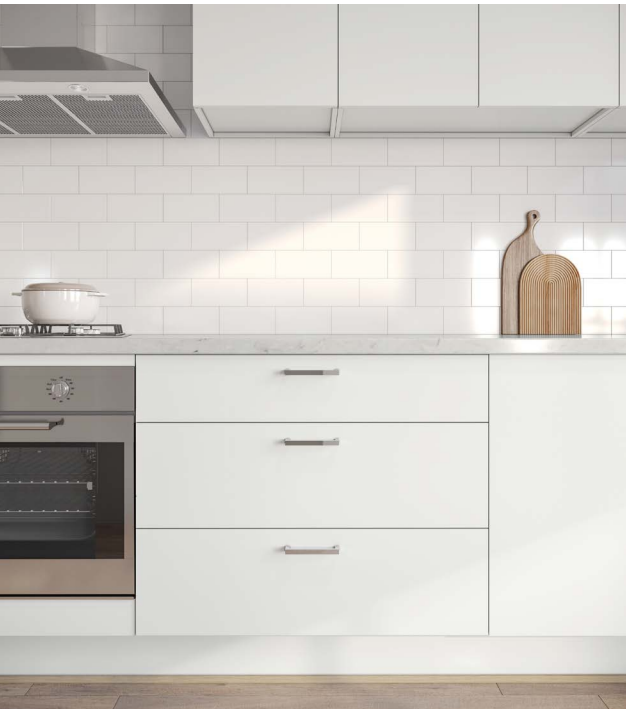
DRAWER OPTION 3 2 large drawers and 1 small drawer up to 600mm wide 2 large drawers and 1 small drawer up to 1000mm wide