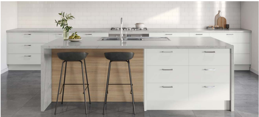
ISLAND BENCH OPTION 6 — 2NO. BANKS OF DRAWERS TO REAR 40mm stone benchtop with double stone dropped end panel and underbench pot drawers (design specific).