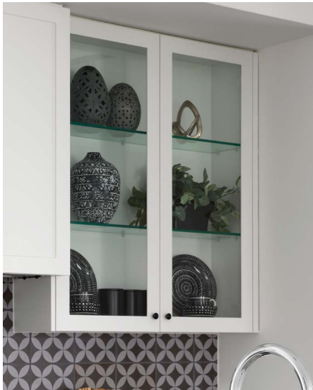
Glass shelving and door inserts.

Speak to your New Homes Consultant to find out more about how you can achieve a personalised design outcome for your Boutique home with our premium joinery design consultation.