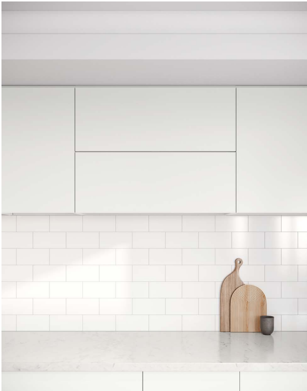
OVERHEAD CUPBOARD OPTION 2 Double fold lift up door. Nominate location