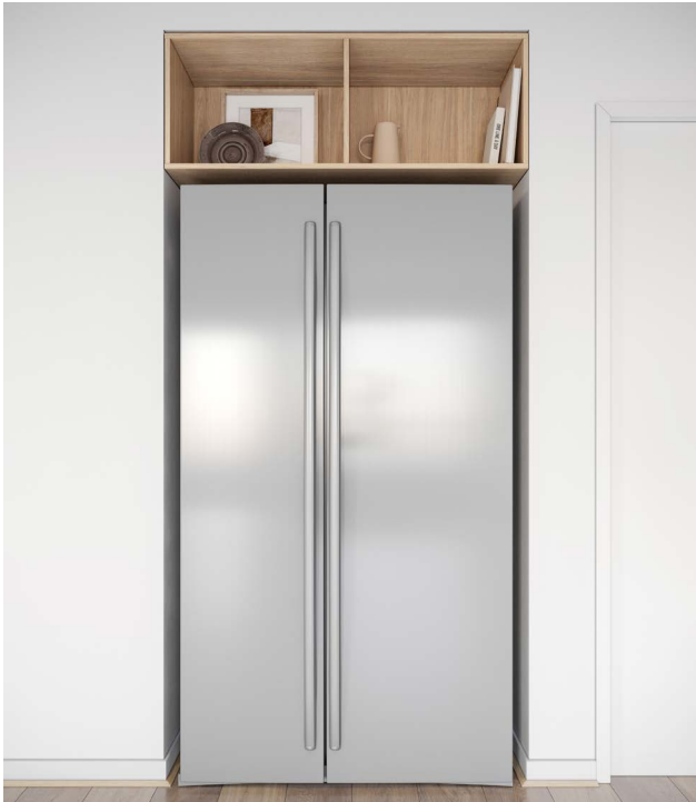
FRIDGE SPACE OVERHEAD CUPBOARD OPTION 3 Laminated open shelf with dividing panel to overhead cupboard above Fridge space