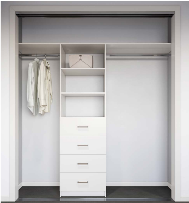
BUILT-IN ROBE OPTION 6

2340mm high robe with double hanging rails to one side. Nominate location: