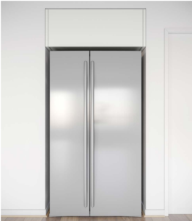
FRIDGE SPACE OVERHEAD CUPBOARD OPTION 1 Single lift-up door above fridge.