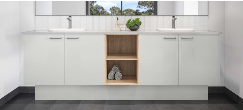
TWIN VANITY OPTION 2 Twin vanity with open adjustable shelf up to 2800mm. Nominate location: